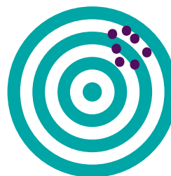
Reliable, not valid