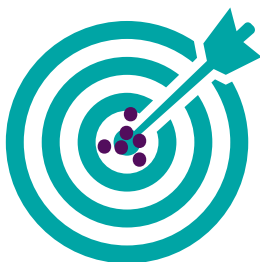
Reliable and valid

Another aspect is predictive validity : the ability of a measure to predict important outcomes at a later point in time. Typically, performance is considered an outcome in its own right, so the predictive validity of people performance measures has been rarely tested. However, we can also look at a measure's convergent validity : that is, its statistical associations with other important outcomes. This is gained from cross-sectional data (measured in a single time period). Convergent validity can be considered less rigorous a test than predictive, in that it does not indicate the direction of causality (which factor is an antecedent and which is an outcome).