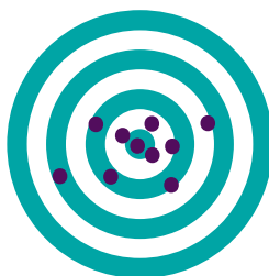
Valid, not reliable